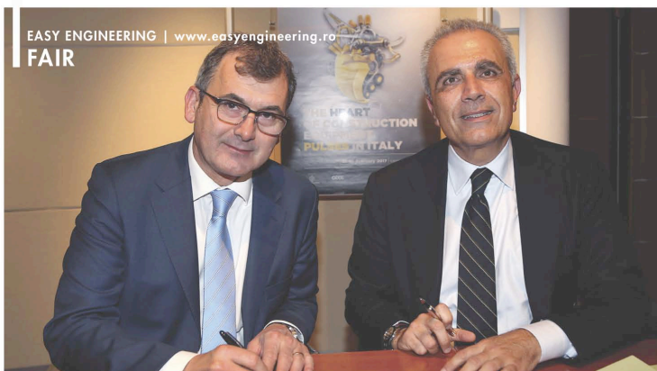
EASY ENGINEERING | www.easyengineering.ro FAIR